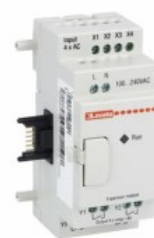
Micro PLC expansion module, 4 digital inputs + 4 relay outputs LRE08RA240 100...240VAC Nr. 4 digital Nr. 4 relay