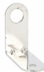
Signal tower Ø50mm/1.97" LTN50