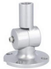
Signal tower Ø50mm/1.97" LTN50