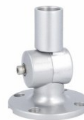
Signal tower Ø70mm/2.75" LTN70