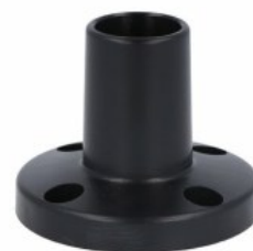
Signal tower Ø70mm/2.75" LTN70