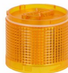
Signal tower Ø70mm/2.75" LTN70