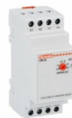
Level control relay for emptying function. Single voltage. Modular version LVM20 Emptying