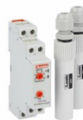
Level control relay LVM25240 with 2 x SN1 electrodes kit LVM25 Emptying or filling