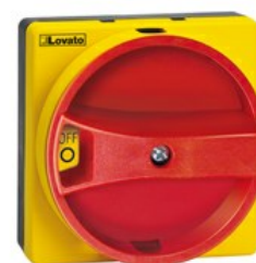
Handles for switch disconnecter GAX6