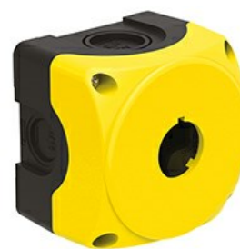
Plastic control station without actuators - for 1 actuators LPZP1A5