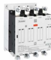
Power contactor BF160