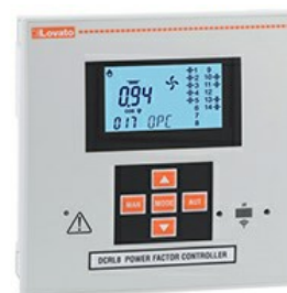
Automatic power factor controller, 8 steps, icon display DCRL8