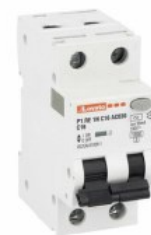
Residual current circuit breakers (RCCB) with overcurrent protection P1RE 1P+N 2 IEC