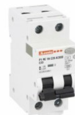
Residual current circuit breakers (RCCB) with overcurrent protection P1RE 1P+N 2 IEC