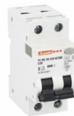
Residual current circuit breakers (RCCB) with overcurrent protection P1RE 1P+N 2 IEC