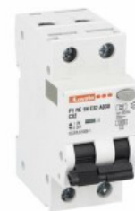
Residual current circuit breakers (RCCB) with overcurrent protection P1RE 1P+N 2 IEC