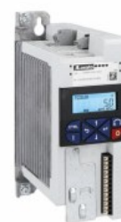
Variable speed drives VLA1