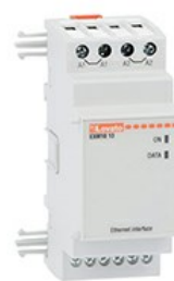
Expansion modules for flush-mount products - communication port EXM1013