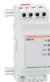
Expansion modules for modular products - communication port EXM1020