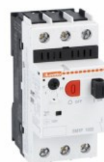
Motor protection circuit breaker SM1P