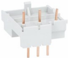
Rigid SM1 breaker-contactor connections SM1X Rigid SM1R breaker - BG contactor connections. SM1R...