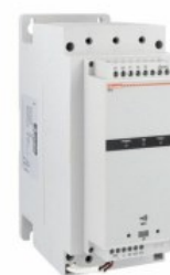
Thyristor modules DCTL