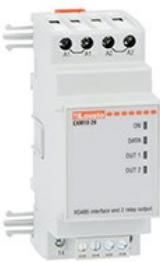
Expansion modules for modular products - communication port EXM1020