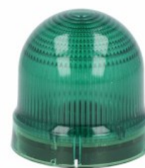
Signal beacons Ø62mm/2.44" 8LB6EL