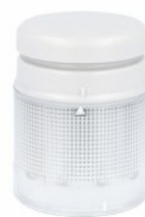
Signal tower Ø70mm/2.75" 8TL7