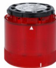
Signal tower Ø70mm/2.75" 8TL7FL - Light modules