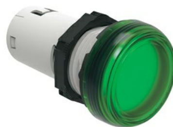
LED integrated monoblock pilot lights steady light LPML