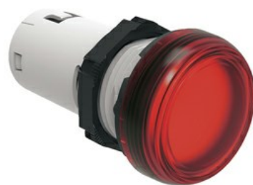
LED integrated monoblock pilot lights steady light LPML