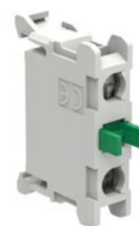
Contact elements, base mount on LPZ control station LPXCB