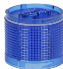
Signal tower Ø70mm/2.75" LTN70