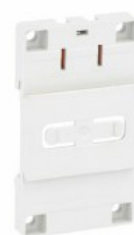
Vertical accessory for battery charger