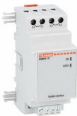
Expansion modules for modular products - communication port EXM1012