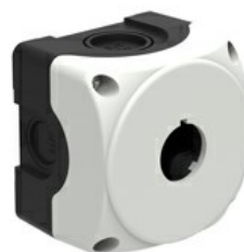
Plastic control station without actuators - for 1 actuators LPZP1A8