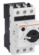
Motor protection circuit breaker SM1R