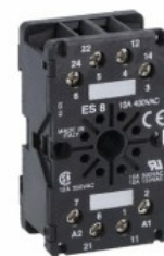
Accessories for level control relays and probes 31S8