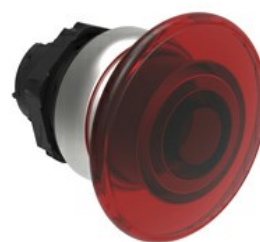
Illuminated mushroom head button actuators - Spring return Ø 40mm/1.6" LPCBL61