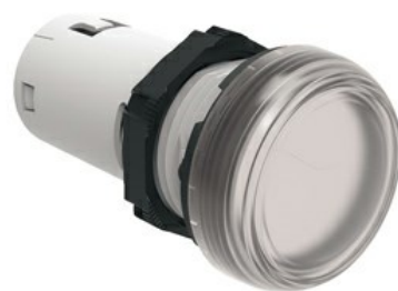
LED integrated monoblock pilot lights steady light LPML