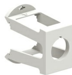
Adapter for mounting LPC... buttons on DIN rail 35mm/1.38" wide (2 modules) LPXDIN