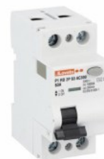
Residual current circuit breakers (RCCB) P1RD 2P 2 IEC