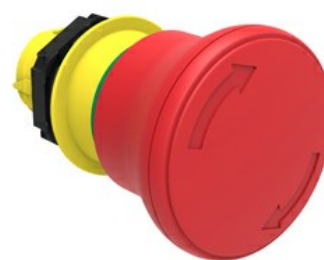
Mushroom head pushbutton, Latch, turn to release Ø 40mm/1.6" LPCB664