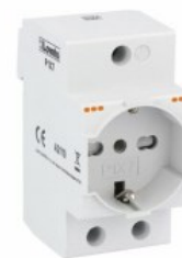
Modular socket Italian and German (Schuko) standard; 16A. P1X7 2.5