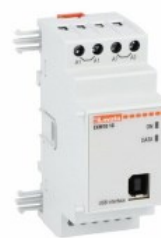
Expansion modules for modular products - communication port EXM1010