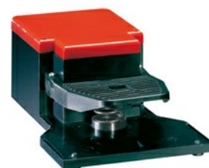
One pedal, with free actuation - open KG100