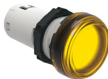
LED integrated monoblock pilot lights steady light LPML