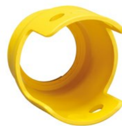
Padlockable protection, Ø5-8mm locks or buttons LPC B66/B67/B68/BL664...; for LPC B634... Ø5-6mm/0.2-0.24" locks only LPXAU158