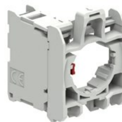
Contact elements - with mountin adapter LPXE