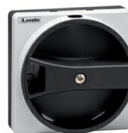
Handles for switch disconnecter GAX6