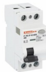
Residual current circuit breakers (RCCB) P1RD 2P 2 IEC