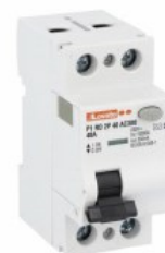
Residual current circuit breakers (RCCB) P1RD 2P 2 IEC