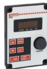
Door-mount keypad for VT1 drives VT1XC02